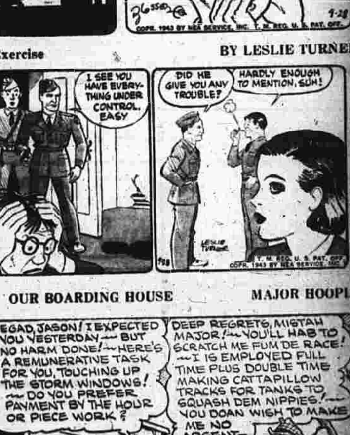
JUST A LITTLE EXERCISE