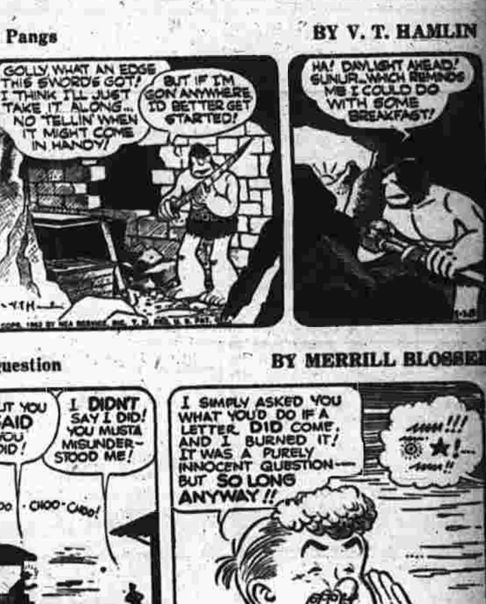
JUST A LITTLE EXERCISE