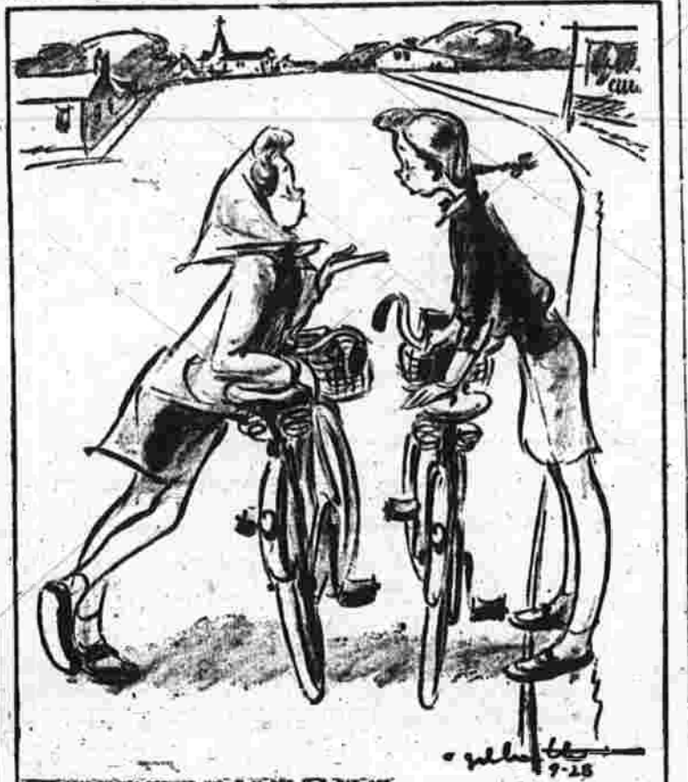
IF I GET SENT TO THE FRONT...