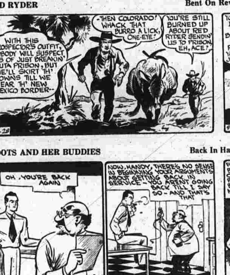
IF I GET SENT TO THE FRONT...